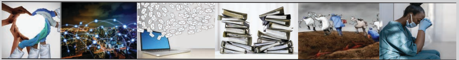
Rural and Social Inequities